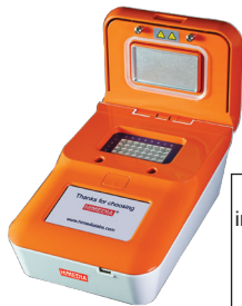
Wee 32™ (LA1060)