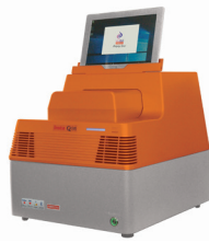
InstaQ™ 48M4 (LA1023)