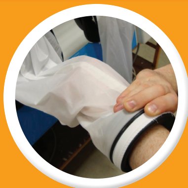
EZEE SLEEVE SYSTEM