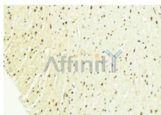
DF4843 at 1/100 staining Mouse brain tissue by IHC-P. The sample was formaldehyde fixed and a heat mediated antigen retrieval step in citrate buffer was performed. The sample was then blocked and incubated with the Ab for 1.5 hours at 22°C. An HRP conjugated goat anti-rabbit Ab was used as the secondary.