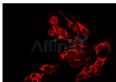
AF3425 staining Hela by IF/ICC. The sample were fixed with PFA and permeabilized in 0.1% Triton X-100, then blocked in 10% serum for 45 minutes at 25°C. The primary Ab was diluted at 1/200 and incubated with the sample for 1 hour at 37°C. An Alexa Fluor 594 conjugated goat anti-rabbit IgG (H+L) Ab, diluted at 1/600, was used as the secondary Ab.

IMPORTANT: For western blot, incubate membrane with diluted primary Ab in 5% w/v milk, 1X TBS, 0.1% Tween@20 at 4°C with gentle shaking, overnight.