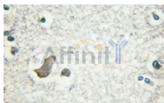
AF3425 at 1/100 staining human brain tissues sections by IHC-P. The tissue was formaldehyde fixed and a heat mediated antigen retrieval step in citrate buffer was performed. The tissue was then blocked and incubated with the Ab for 1.5 hours at 44°C