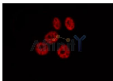
AF3387 staining HeLa by IF/ICC. The sample were fixed with PFA and permeabilized in 0.1% Triton X-100, then blocked in 10% serum for 45 minutes at 25°C. The primary Ab was diluted at 1/200 and incubated with the sample for 1 hour at 37°C. An Alexa Fluor 594 conjugated goat anti-rabbit IgG (H+L) Ab, diluted at 1/600, was used as the secondary Ab.

IMPORTANT: For western blot, incubate membrane with diluted primary Ab in 5% w/v milk, 1X TBS, 0.1% Tween@20 at 4°C with gentle shaking, overnight.