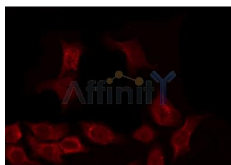
AF3045 staining SK-OV3 by IF/ICC. The sample were fixed with PFA and permeabilized in 0.1% Triton X-100, then blocked in 10% serum for 45 minutes at 25°C. The primary Ab was diluted at 1/200 and incubated with the sample for 1 hour at 37°C. An Alexa Fluor 594 conjugated goat anti-rabbit IgG (H+L) Ab, diluted at 1/600, was used as the secondary Ab.

IMPORTANT: For western blot, incubate membrane with diluted primary Ab in 5% w/v milk, 1X TBS, 0.1% Tween@20 at 4°C with gentle shaking, overnight.